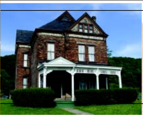
Top: Hancock County Courthouse Bottom: Hancock County Historical Museum